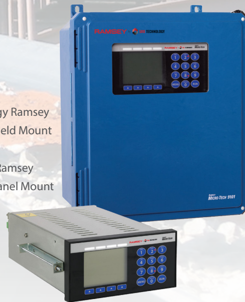
SRO Technology Ramsey Micro-Tech 9101 Panel Mount

The Micro-Tech 9101 scale integrator electronics provides the intelligence to the weighing system, integrating output signals from the weighbridge and speed sensors to arrive at a rate of material flow and total material passed over the scale. The electronics also functions as the system power supply and incorporates all features that allow calibration, operation and diagnostics for the system.